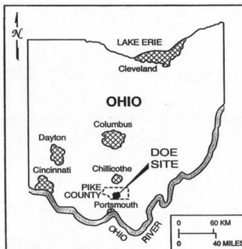
Figure 1.2. Location of PORTS within the State of Ohio.

The DOE, through its managing contractors, is responsible for the Environmental Restoration, Waste Management, and Uranium Programs at the plant, as well as other nonleased DOE property. The Environmental Restoration Program performs remedial investigations and remedial actions to define the nature and extent of contamination, to evaluate the risk to public health and the environment, and to remediate areas of contamination at PORTS. The goal of the Environmental Restoration Program is to verify that releases from past operations at DOE PORTS are thoroughly investigated and that remedial actions are taken to protect human health and the environment.