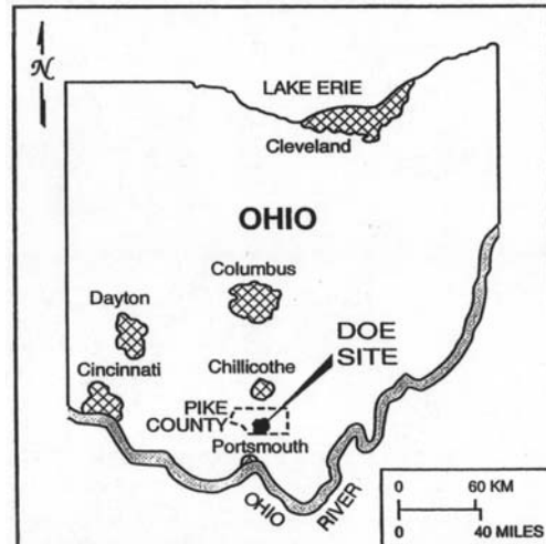
Figure. 1.2. Location of PORTS within the State of Ohio.

The Waste Management Program is responsible for managing wastes generated at the site. Wastes must be identified and stored in accordance with all environmental regulations. The Waste Management Program also arranges transportation and off-site disposal of wastes. The goal of the Waste Management