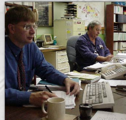
2001 Plant Shift Superintendent oversees day-to-day operations