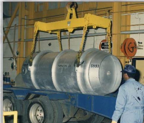
1990 Uranium cylinder movement