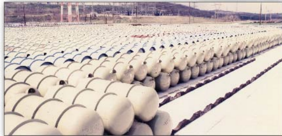
1989 Depleted Uranium Hexafluoride (DUF 6 ) cylinders