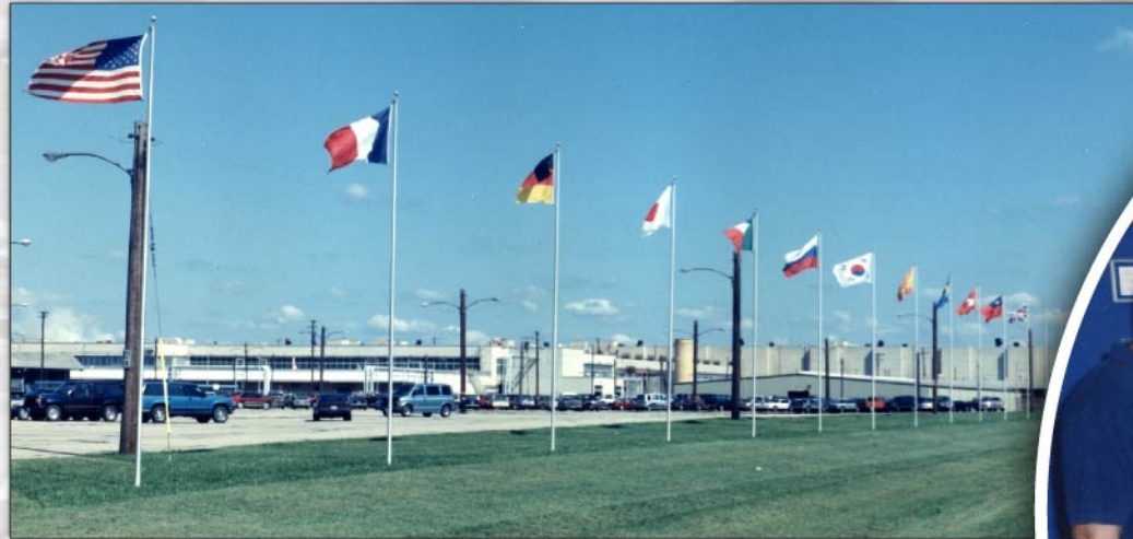
1994 International flags flown to represent customers throughout the world