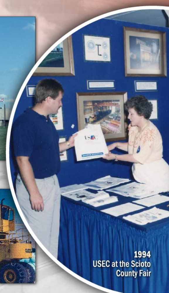
1994 USEC at the Scioto County Fair