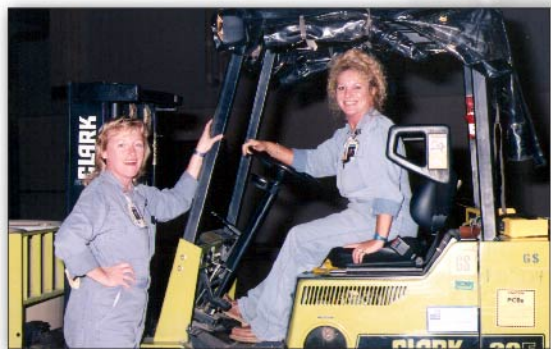
1997 Shipping and receiving