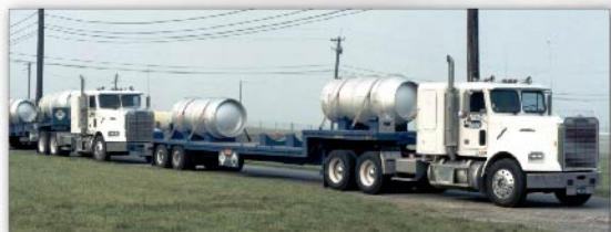
1989 Uranium shipment