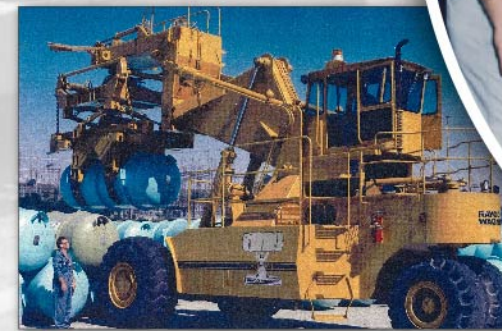
1994 First USEC cylinder