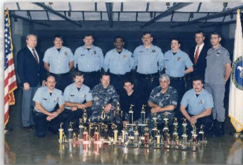
1990 Protective Forces Pistol Team