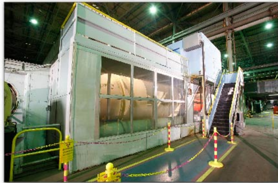
1989 X-333 Demonstration cell

2011 USEC turns over contractual responsibilities to Fluor-B&W Portsmouth.