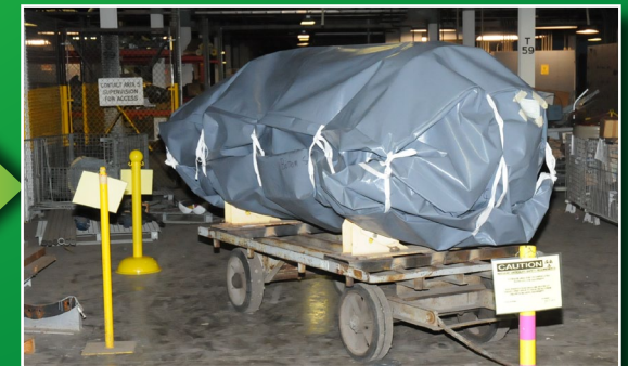
Converter is placed in soft-sided shipping bag for storage prior to shipment.