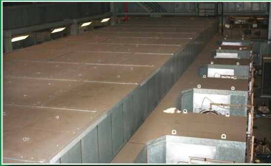
Cell components are housed within a heated enclosure for temperature control.