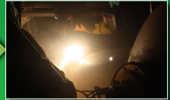
Converter detached from the interconnecting piping using a carbon arc torch.