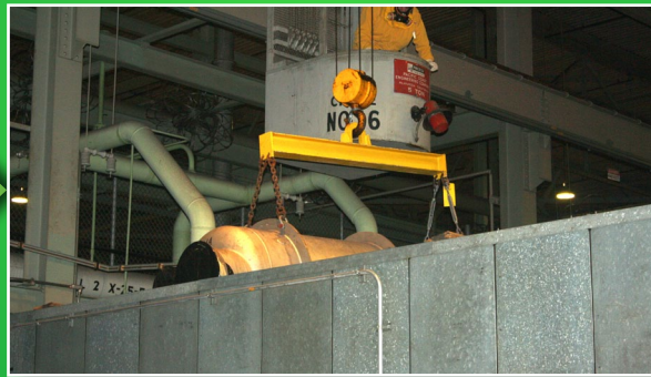
Converter is raised from the cell using the crane.