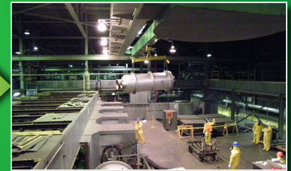
Once removed from the cell housing, the converter is moved to a transfer cart.