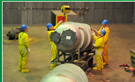
Metal plates are welded to secure the openings and the converter is decontaminated as necessary.