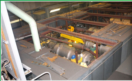
The converter lifting fixture is lowered into place by the overhead bridge crane and attached to the converter.