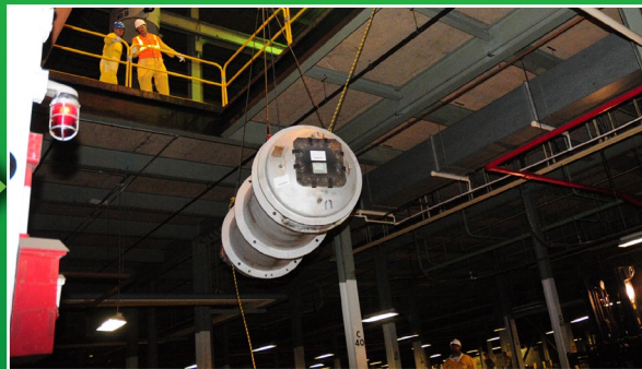
Converter is lowered to the operating floor.