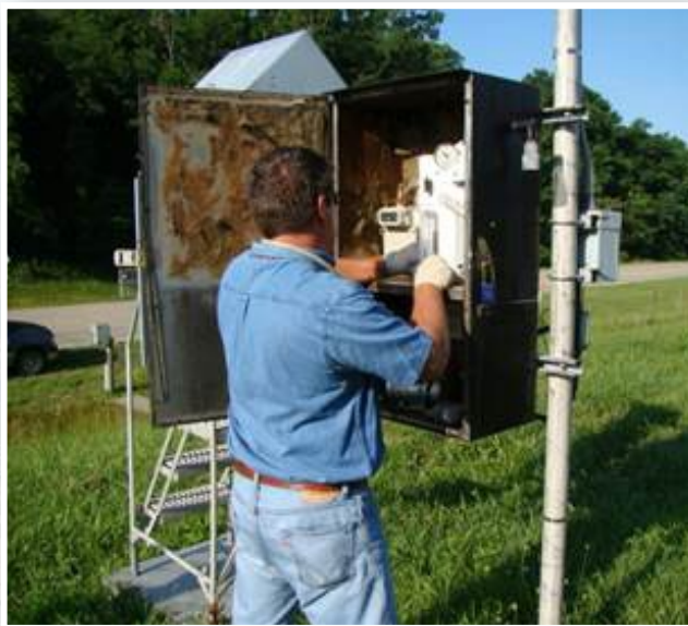
Air Monitoring Station